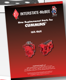
ISX / QSX Catalog

Interstate-McBee is pleased to announce the availability of inframe engine kits for Cummins ISX engine applications. Interstate-McBee pistons are the latest “narrow” window design and produced from a steel forging for maximum strength and durability. Drilled connecting rods must be used with these pistons. The cylinder liners feature an induction hardened plateau honed finish. Interstate-McBee ring sets feature steel fire ring and oil control rings for excellent seal ability. Please ask for your copy of our new ISX / QSX reference catalog today along with our handy laminated wall chart for easy application information.