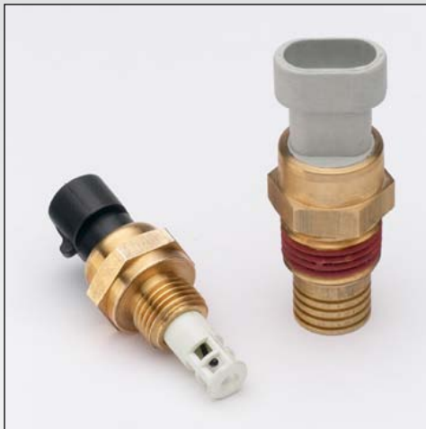
M-2644297 Sensor – Temperature

Additional sensors for Navistar® DT466E and for popular Caterpillar® applications from Interstate-McBee