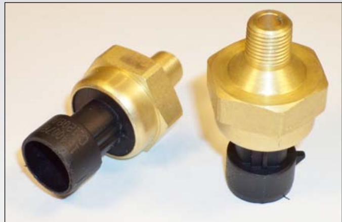
M-1840078C1 Sensor – Pressure Transducer