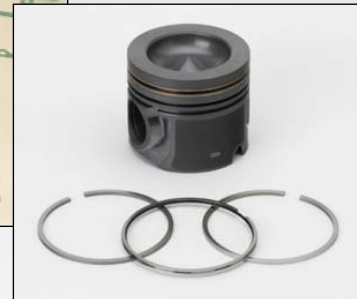
M-2627330 phosphate coating and graphite coated skirts.

Interstate-McBee is now stocking engine overhaul kits, piston kits and gasket kits for the popular C7 engine applications. The 3 new pistons feature complete phosphate coating along with graphite coated skirts for reduced friction. In addition to the low friction coatings, the M-2627330 piston features oil gallery cooling for high horse power applications. The new Interstate-McBee custom gasket kits contain the M-1662905 integral seal (reusable) oil pan gasket in the overhaul and inframe overhaul set. A graphite composite head gasket that features multiple reinforcement layers for increased durability is also contained in all three sets. Cylinder liner repair sleeve part number M-1077604 is also available for repair of the cylinder bores.